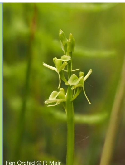
Fen Orchid