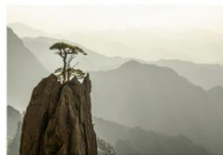
Mentoring & 1 to 1's

For over a decade now we have been showing photographers the best skills in the field and also how to edit and interpret their images to get exhibition quality images. With an extensive range of workshops, online tuition and 1 to 1's, we can help you become a better photographer.