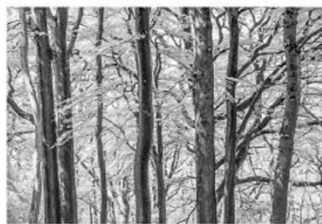
One Day Workshops