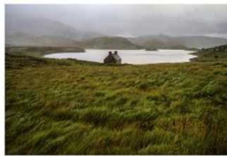
UK Photography Workshops